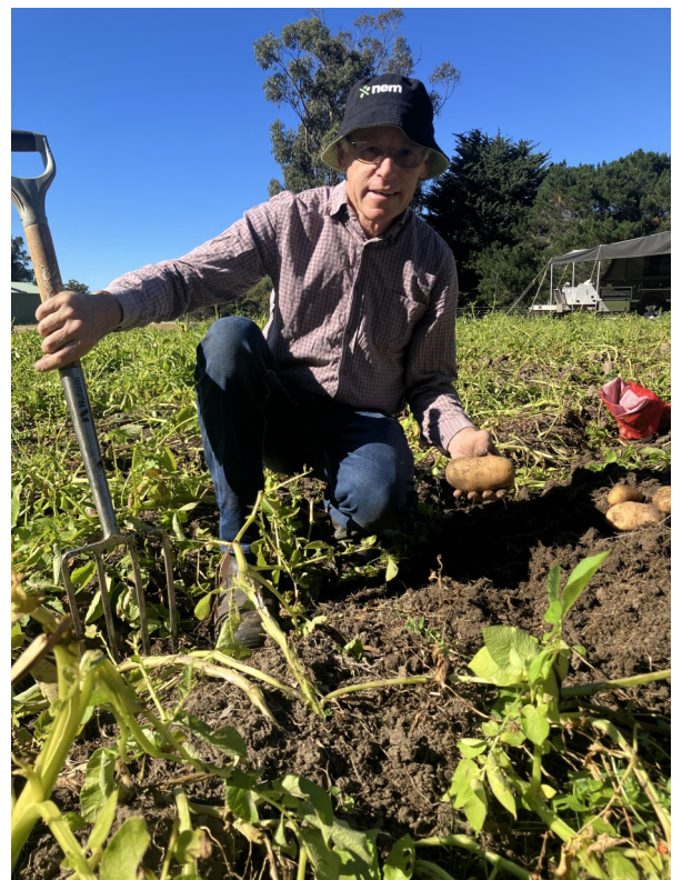
Above: Picking our first potatoes at Forest Glen

PS Would you prefer to receive your Fusion News by email? Email to southtas@fusion.org.au and you'll receive the next Fusion newsletter in your inbox.